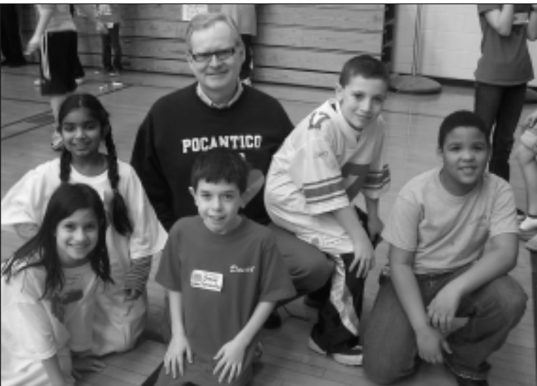
JUMP ROPE FOR HEART