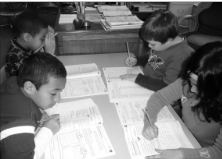
Second graders get down to basics