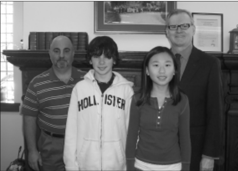
ALL COUNTY-STATE BAND