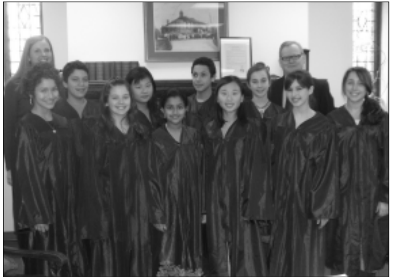
ALL COUNTY-STATE CHORUS